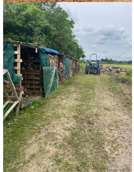
one of our piles of refurbished bricks (top) and the new log stores (above)