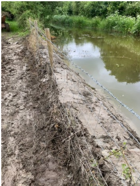
the completed repair to the leak just waiting for ten grass to grow back

Work on fitting out Cabin #4 for Bob Howlett and the Boat Team has continued. Shelving has been completed, which opens up the floor space.