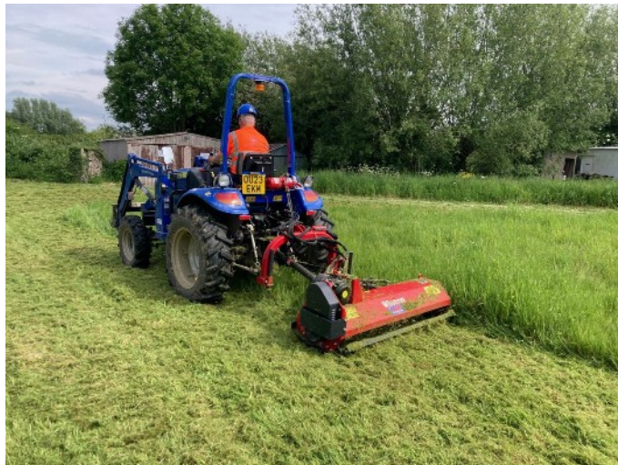
the verge flail mower in action at the Chippenham Sea Cadets