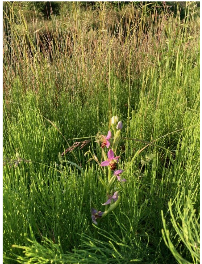
Bee Orchid (above) coppiced Hazels regrowing (below, left) and cherries (below, right)

The new hedge by the Carpenters Workshop is progressing well and has been weeded and mulched to give it an extra boost.